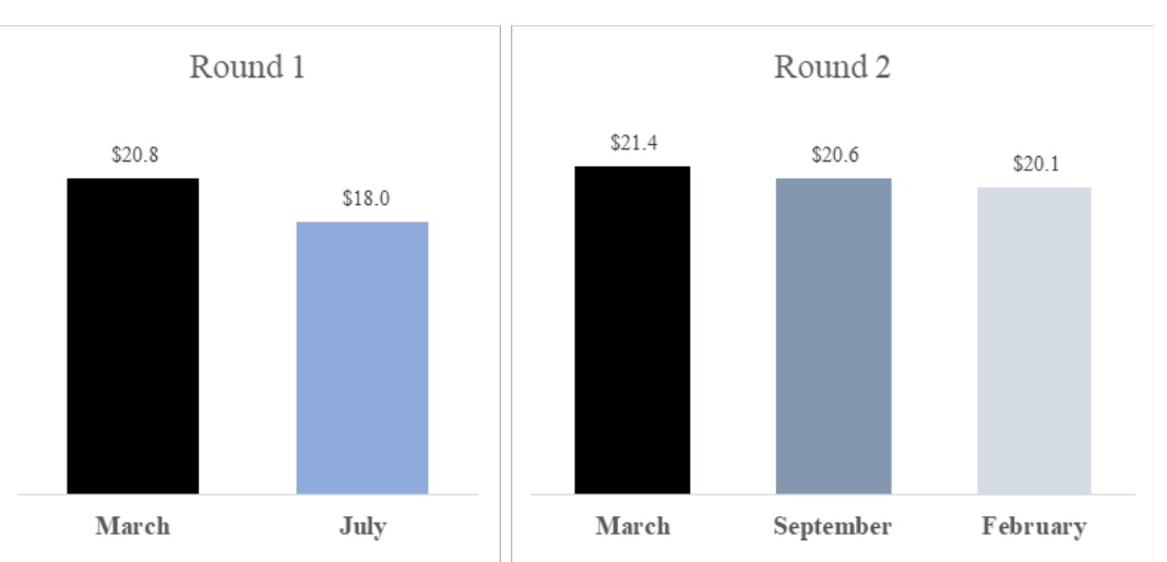
Figure 4 Average per capita per day income in PPP$ by survey Round 1 (March and July 2020) and survey Round 2 (March 2020, September 2020, and February 2021)

Estimates are based on panel households with income data reported in both the months--March and July in Round 1 (N=717) and in all three months--March, September, and February in Round 2 (N=749).