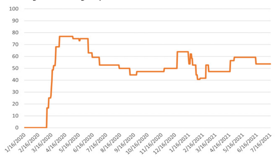
Figure 2. Stringency Index